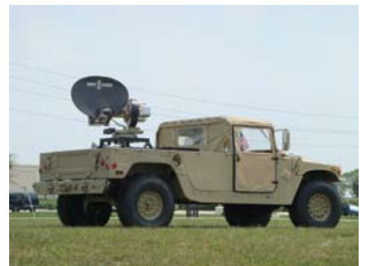
SWE-DISH Demonstrator - tested for land and for naval use during the last year.